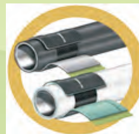
GTS - PE & GTS - PP