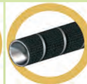
Wrapid Shield™ PE